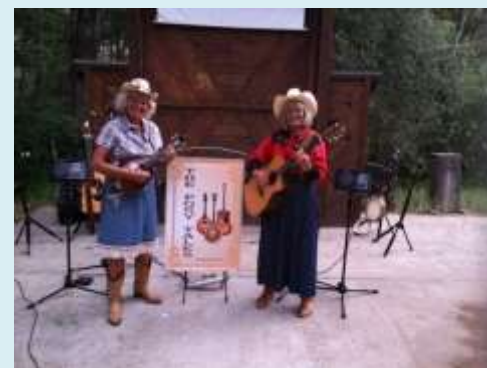
Music by the Pony Tales