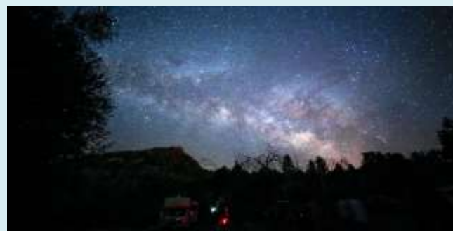
Stargazing with the San Diego Astronomy Association