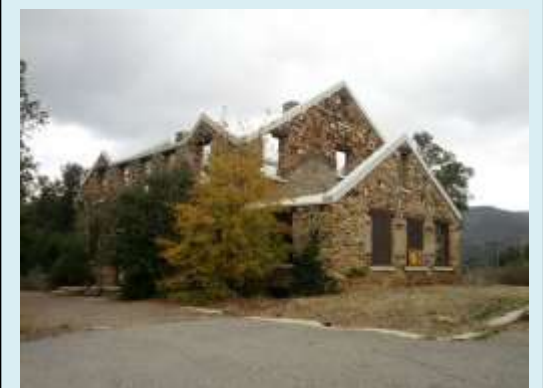
Support our campaign to rebuild The Dyar House which will house our Sector Headquarters, Visitor Center, Museum, Gift Store, and Volunteer Ready Room.