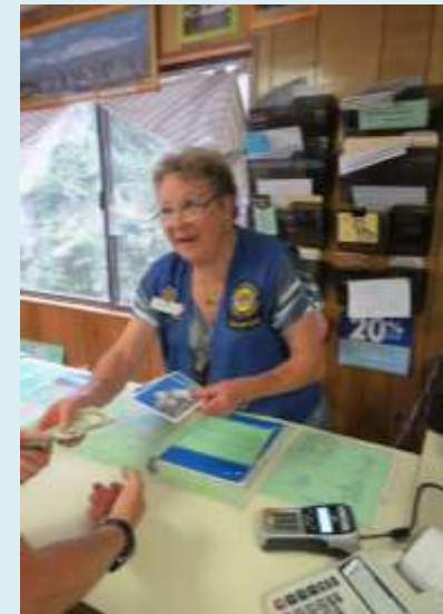
Volunteer in the Visitor Center

Volunteer in the Visitor Center gift store or as a Camp Host.