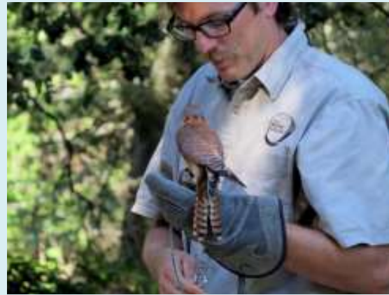
Presentation by the Raptor Institute